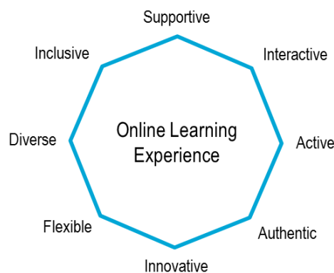
Figure 2 The eight principles that define TU Delft's Online Learning Experience

The Online Learning Experience (OLE) is a student-centred, online learning model that holds eight interrelated principles, which define TU Delft's online courses.